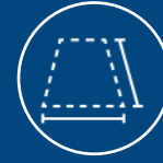
FULL FLOOR PLATE