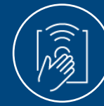
DEDICATED SERVER ROOM