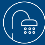
PRIVATE BATHROOM WITH SHOWER