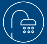
PRIVATE BATHROOM WITH SHOWER